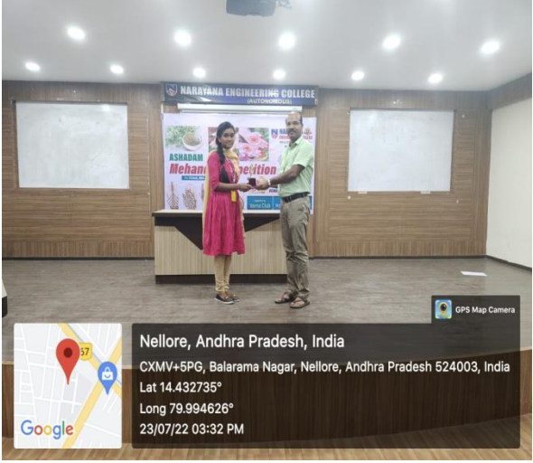
Prize Distribution to the Winners of the Event