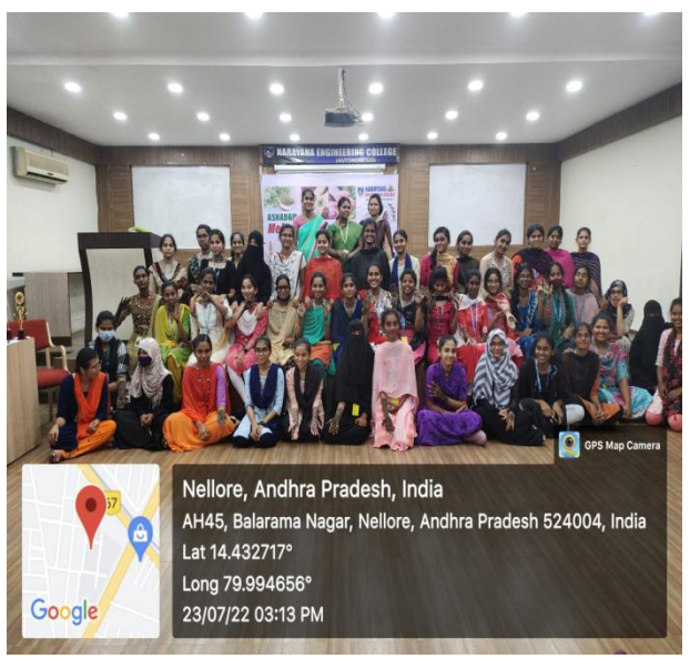
Students Gathering of the event