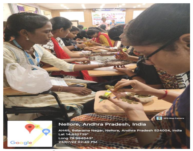
Students participation in the event